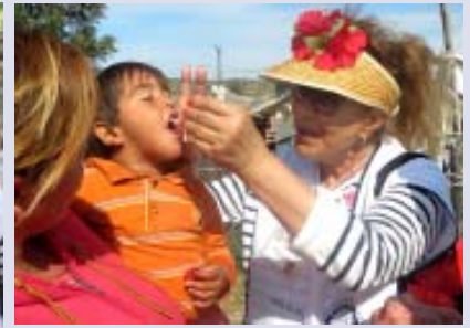
Polio Plus in Action!