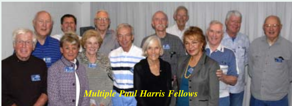
Multiple Paul Harris Fellows