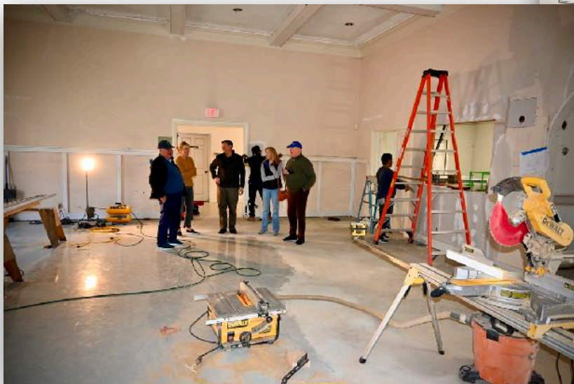
Visiting the Parlor (new Community Center)