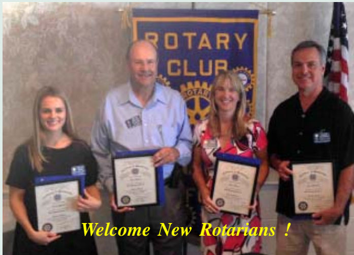
Welcome New Rotarians !